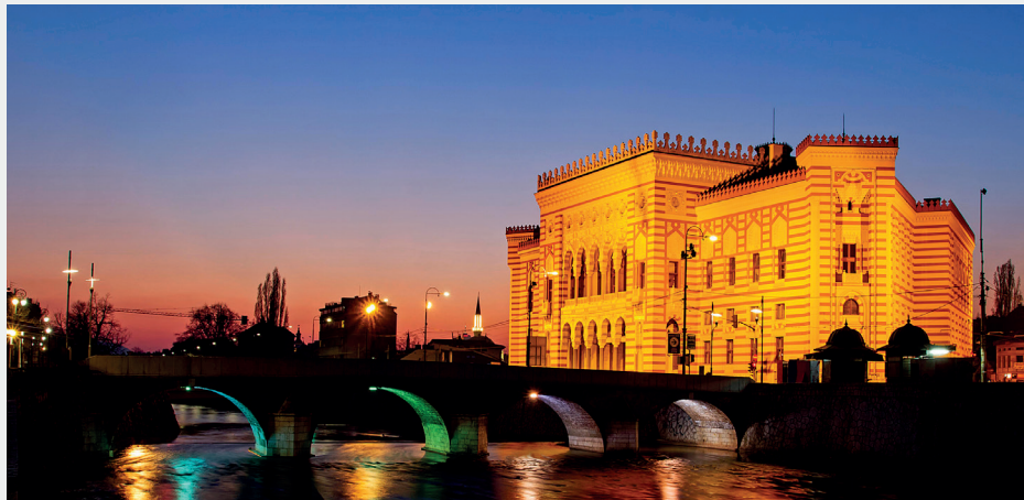
Vijecnica (st. Obala Kulina Bana)

After the opening ceremony, you are invited to the dinner at the Vijecnica (City Hall).