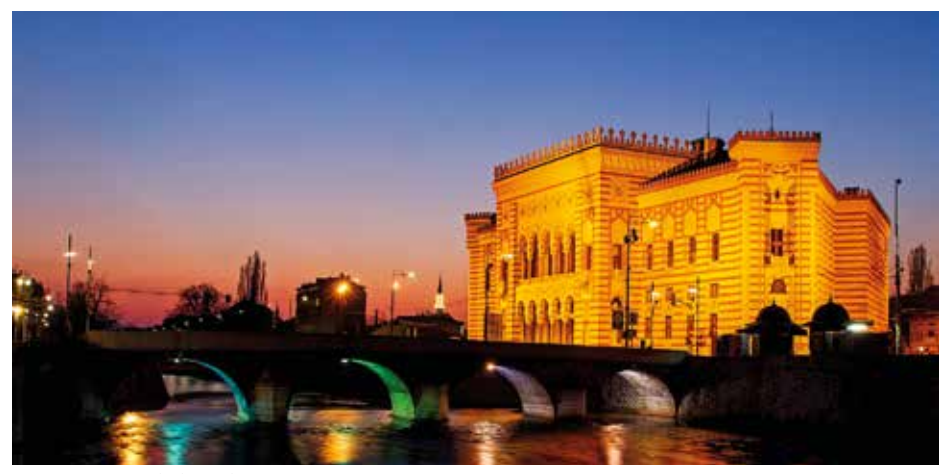
Vijecnica (st. Obala Kulina Bana)

After the opening ceremony, you are invited to the dinner at the Vijecnica (City Hall).